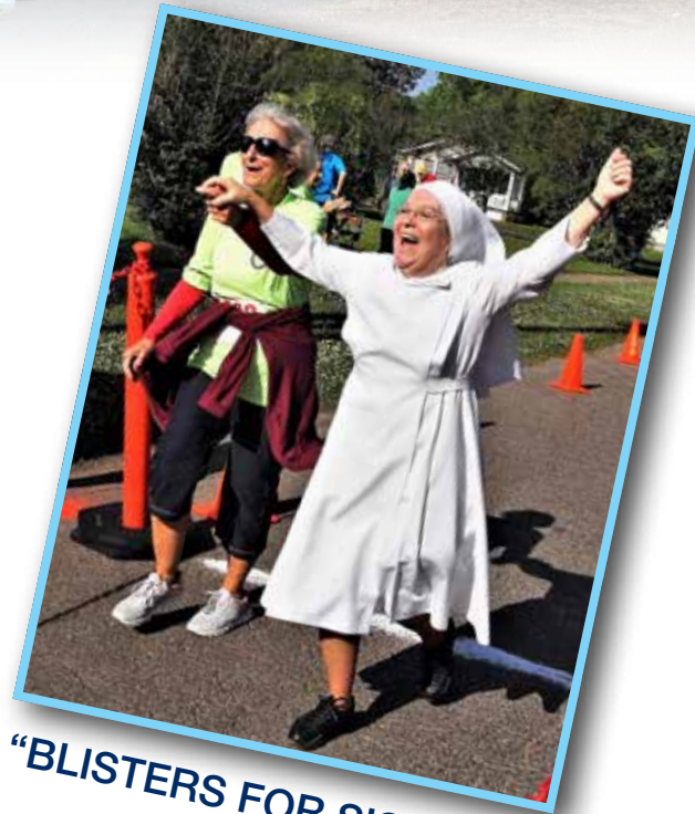
“BLISTERS FOR SISTERS!”