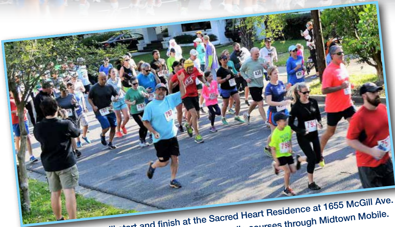
LOCATION: Race will start and finish at the Sacred Heart Residence at 1655 McGill Ave. DISTANCE: Certified 5K (AL13044JD) and one-mile courses through Midtown Mobile.