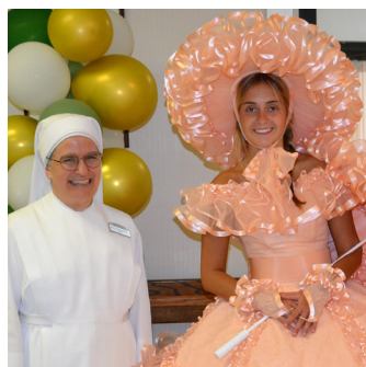
Welcomed by Azalea Trail Maid