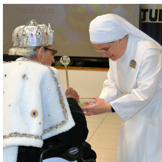
King Cake Presentation