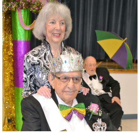
King - Briand Saba